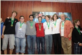
The Winners of the Junior Teams Championship, Opatija 2015